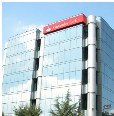
Santander Serfin Corp Santa Fe, Mexico