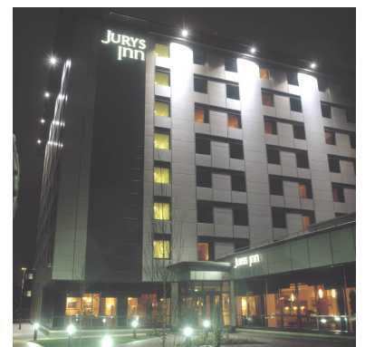
Jury's Inn Heathrow, UK