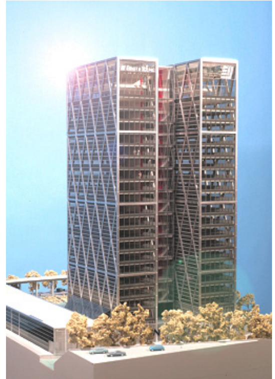
Some 15,000m 2 of glass in total will be protected with ClearShield

This building utilises a series of environmentally progressive measures and is 10% more energy efficient than current Dutch requirements. For example, the Vivaldi building features a zero emission heating and cooling system using geothermal power. In addition, ClearShield-protected glass will ensure that all glazing retains its high photometric properties by remaining resistant to staining and weathering, despite the building's busy urban location. Cleaning time and costs will also be reduced, without the need for harsh chemicals to keep the glass in pristine condition. But ClearShield will give benefits well before the completion of the building.